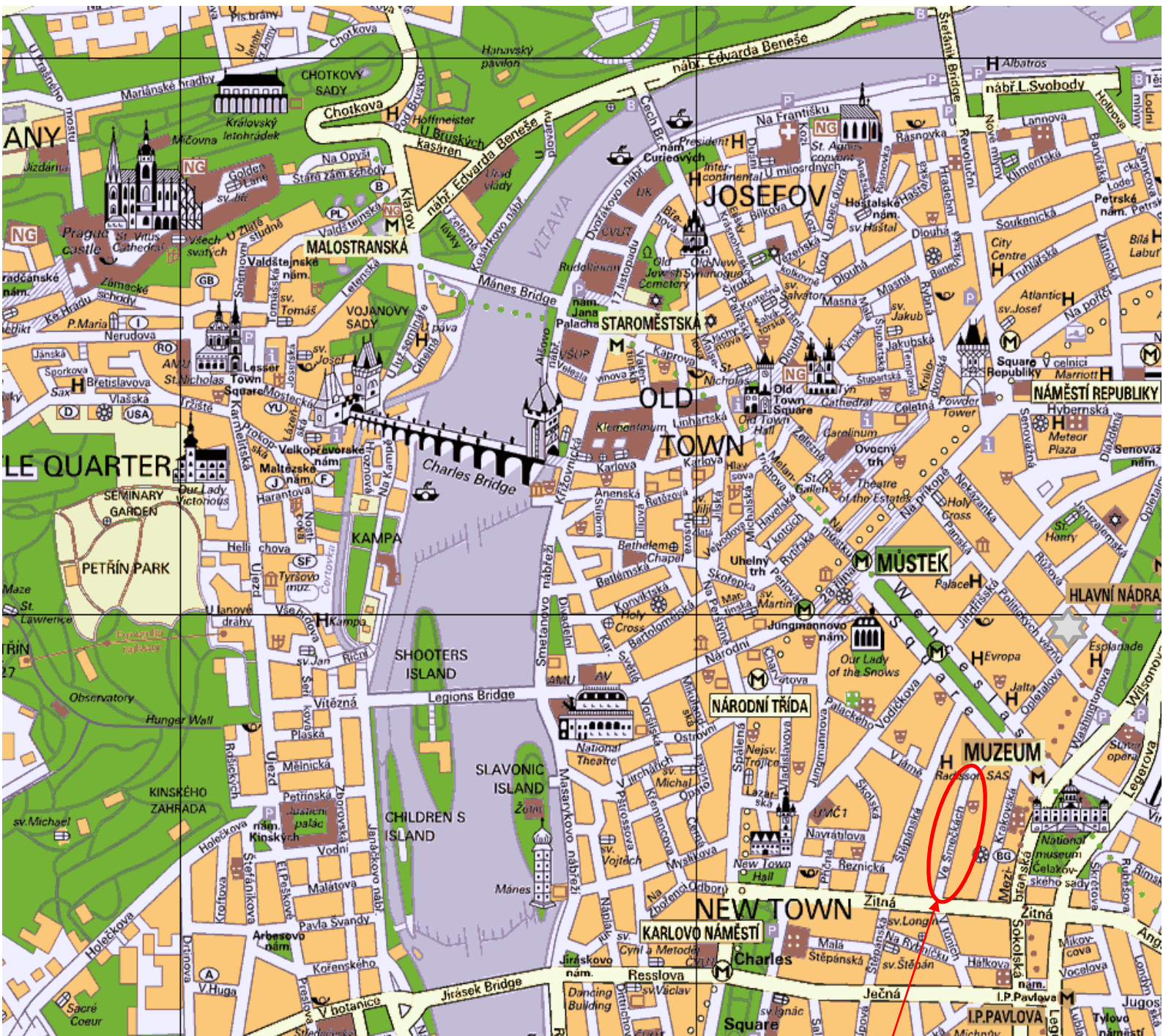
Accommodation Smečky 14